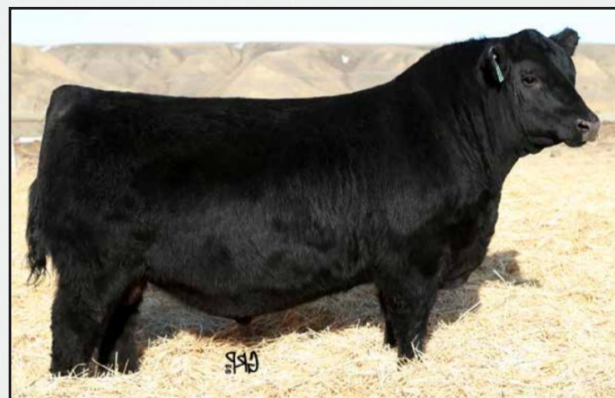
U2 OZARK 474G :: SIRE OF LOTS 35-39

Ozark's famous and high-selling dam, Erelite 109Z, is best known as the dam of the popular U-2 Coalition. He's been doing a great job for us, we like the eye-appeal and muscle evident in his sons.