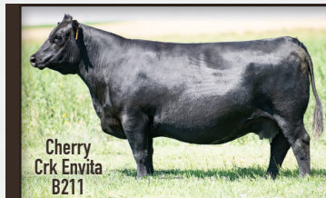
Cherry Crk Envita B211

Full Brother to the Dam of "Working Class"