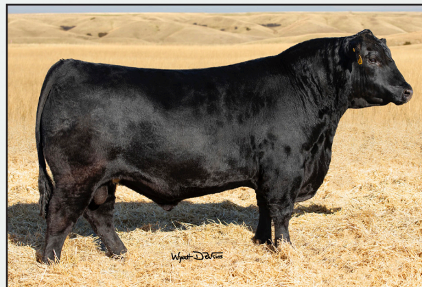
BALDRIDGE VERSATILE :: SIRE OF LOTS 1-14

We bought into the Baldridge Versatile bull when he sold for $250,000 in 2021, joining a syndicate of Angus breeders. He has proven to be a good investment, with his now progeny proven EPD's showing him to be a calving ease bull with strong growth, great Heifer Pregnancy, and breed-leading Docility and Marbling, ranking in the top 1% for both traits. As an added bonus, possibly his best attribute will be the females he sires, with his first calved daughters impressing all who've used him with their gentle natures, and with their perfect, well attached udders, with small teats.