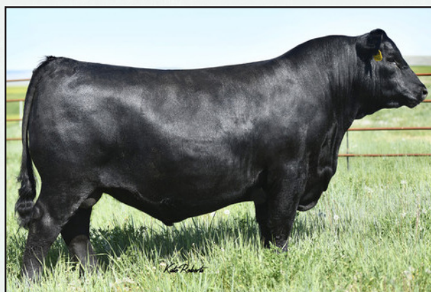
LAR MAN IN BLACK :: SIRE OF LOTS 62-65