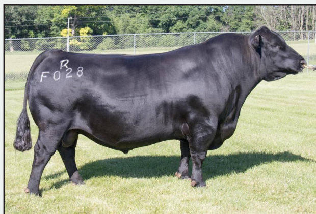
TEHAMA PATRIARCH F028 :: SIRE OF LOTS 66-72