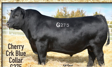
Cherry Crk Blue Collar G275

AAA 20420686 Semen $35 Certificates $40 Volume Discount Eligible