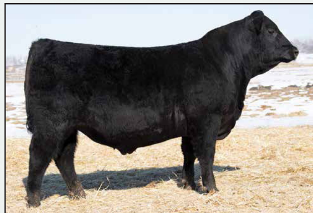
VERMILION BOMBER G017 :: SIRE OF LOTS 15-21

G017 has been working extremely well for the breeders who've used him, adding more growth and more muscle than his popular sire.