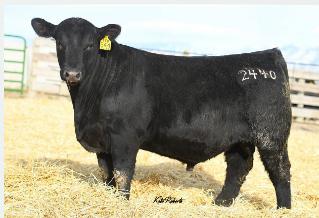
VDAR GALLATIN 2440 :: SIRE OF LOTS 43-45