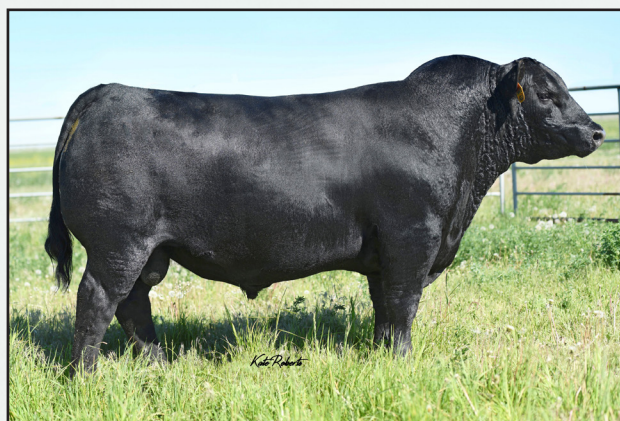
WOODHILL COMSTOCK :: SIRE OF LOTS 55-61