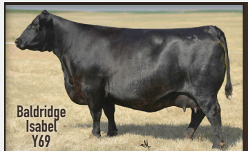
Baldridge Isabel Y69