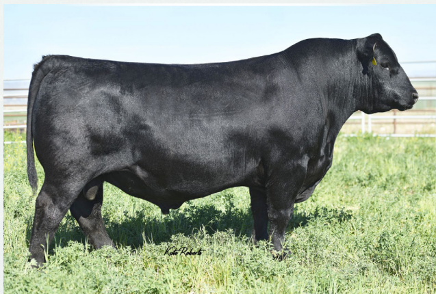
EXAR STOCK FUND 9097B :: SIRE OF LOTS 40-41

The Ozark sons will be a good choice if you're concerned about keeping a lid on mature size of your cows, and they are always among our most popular bulls on sale day!