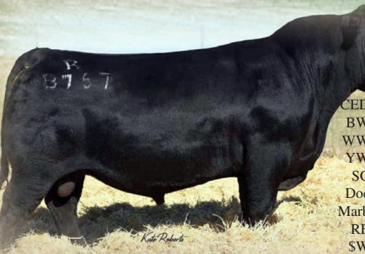
Tehama Tahoe B767 • 17817177

ED +10 BW +0 WW +75 YW +129 SC +1.05 Doc +22 Marb +.92 RE +.90 $W +102 SF +86 $B +154 SC +290