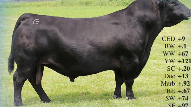
$F +97 Baldridge Command C036 • 18219911