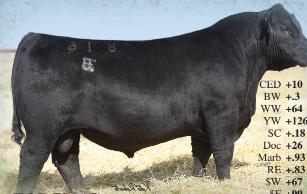
E&B Plus One • 19196960