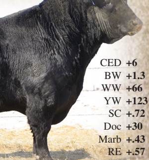
U-2 Coalition 206C • 18626847